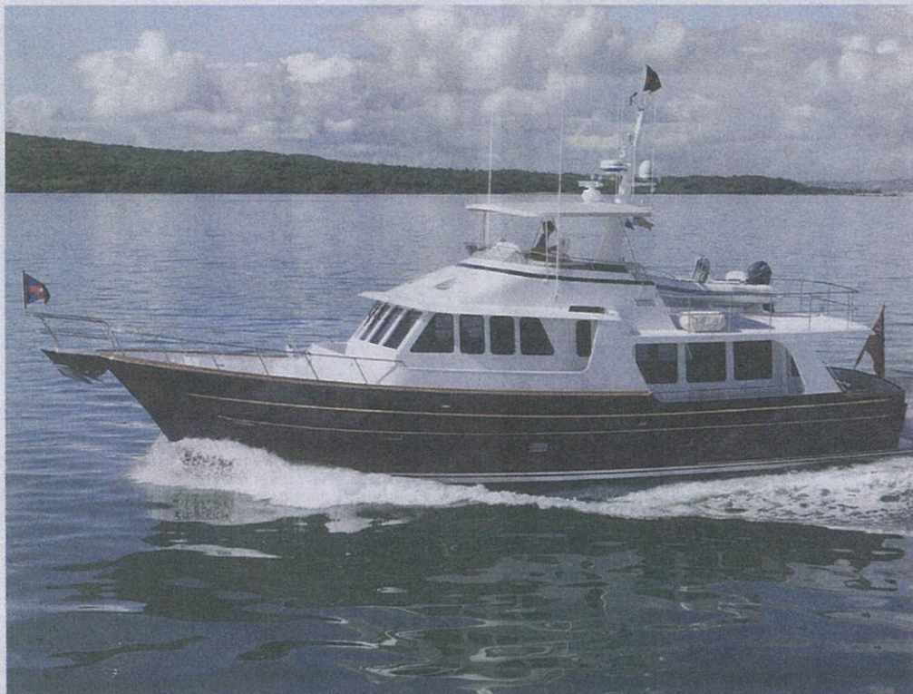
• To page 18 Best of boat worlds: The virtual boatbuilding process puts clients in control of the job, while the project is 'expertly' managed by Diverse Projects.

Vitali says the process could mark a new beginning for the boat building industry in New Zealand.